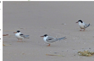
3.

It's Election Time! Our By-Laws call for an election of officers to be held at the Annual Meeting held each November. To that end, we will conduct a brief business meeting following the potluck in order to elect Club Officers for the coming year. The Board will present a slate of candidates, but we also welcome nominations from the floor. The positions open include, President, Secretary, and the Chairs for Public Relations, Programs and Mini-grants.